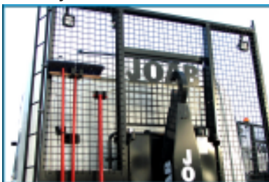
Impact tested head board