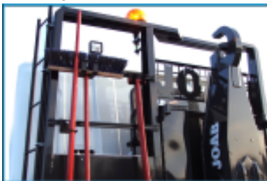
Tank, valve and tool brackets