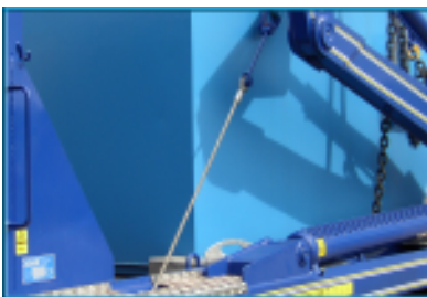
Hydraulic load securing